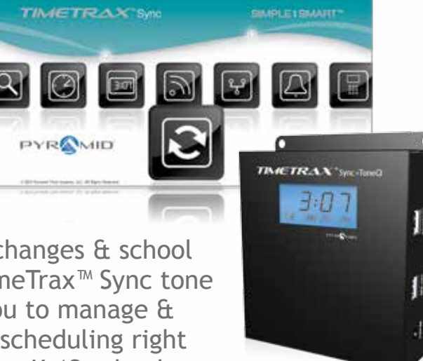
SEDSTSLAUB Tone-Q, 110-Volt Ethernet Tone Generator

manufacturing plants, distribution centers & correctional facilities.